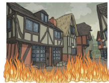
The Great Fire of London