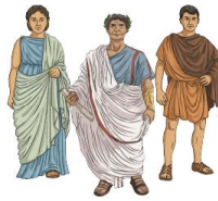
Romans in Britain