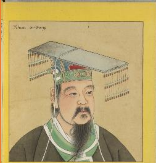
King Wu of the Zhou