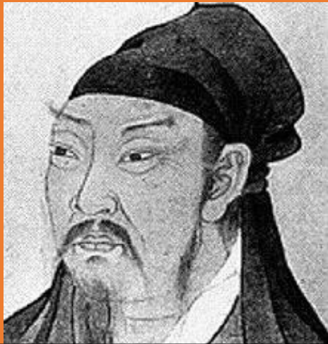
Jiang Ziya, a noble of the Zhou