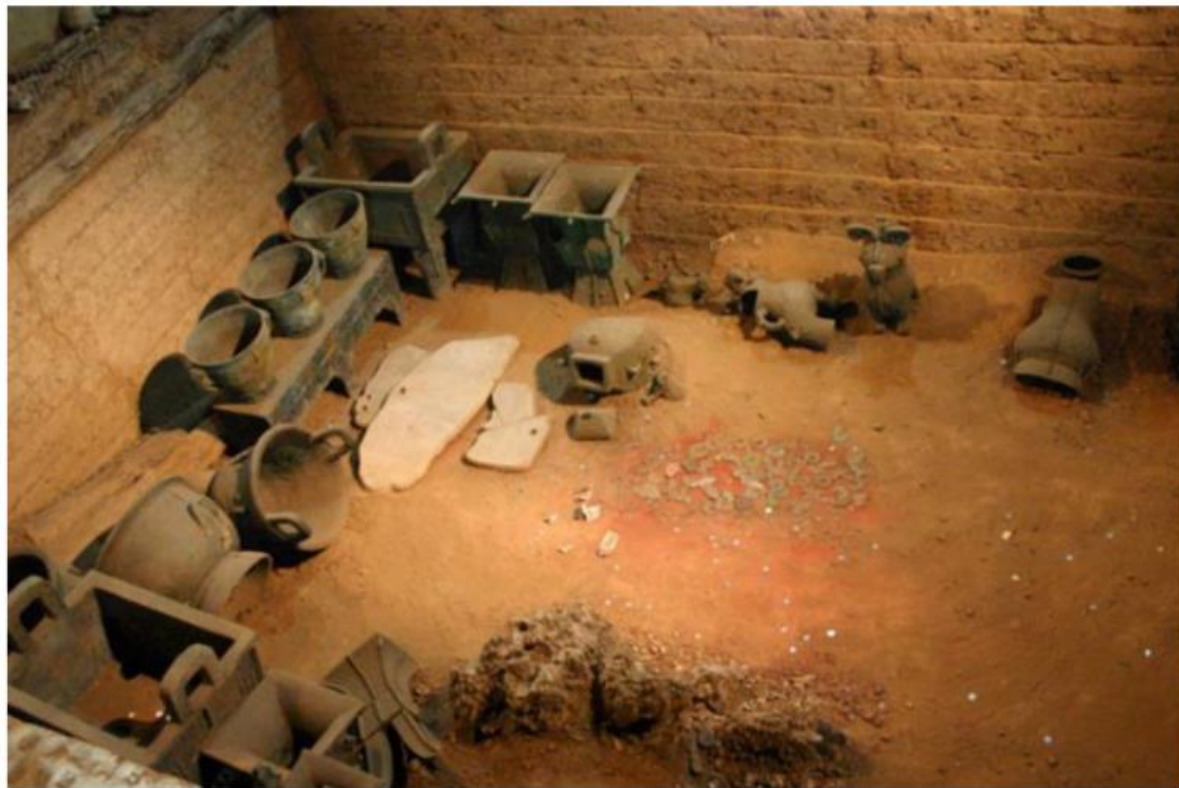
The tomb of Fu Hao, wife of Emperor Wu Ding.