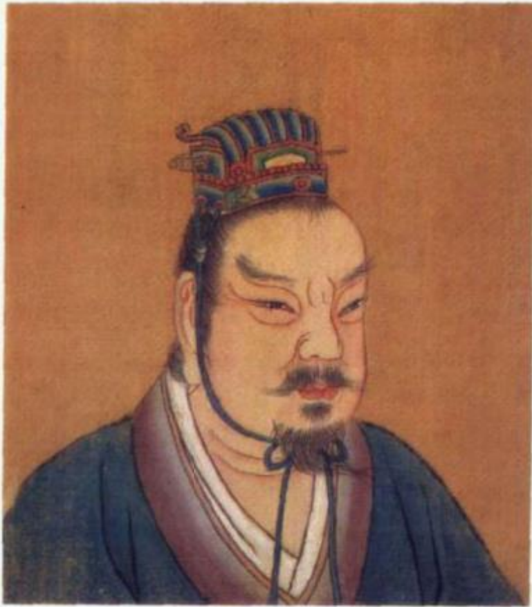
武丁 (? - 前1191) 清人绘