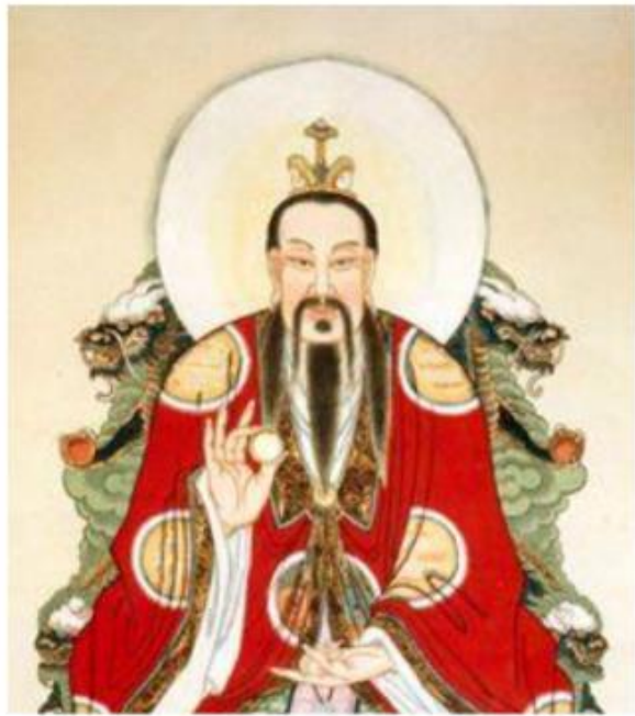
A portrait of Shangdi