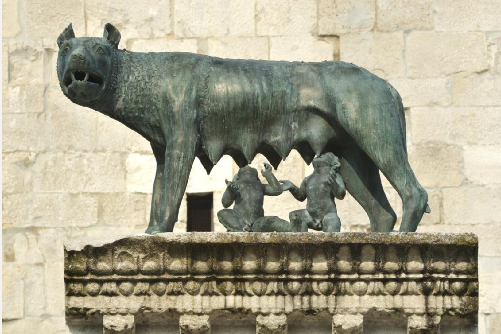
Romulus and Remus